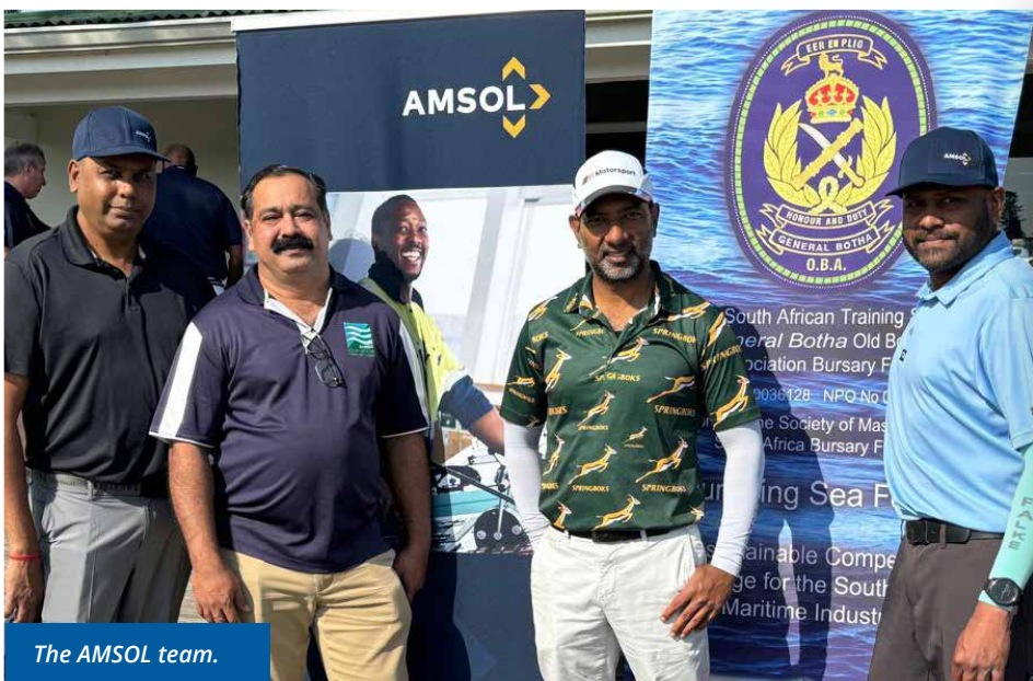
The AMSOL team.

Mount Edgecombe was the venue for Golf Day on 24 July. Thank you to everyone who attended and those who worked tirelessly to make this a successful event raising much needed funds for tertiary bursaries.