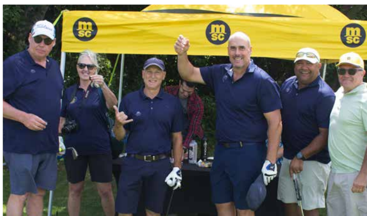
The fantastic Fairship Team enjoying the hospitality at the MSC watering hole

It was an honour that the Bursary Fund was included in the Centenary celebrations of the South African Training Ship General Botha. The Old Boys' Association donated R70 000 to the Bursary Fund to mark this momentous year and sponsored a wonderful video.