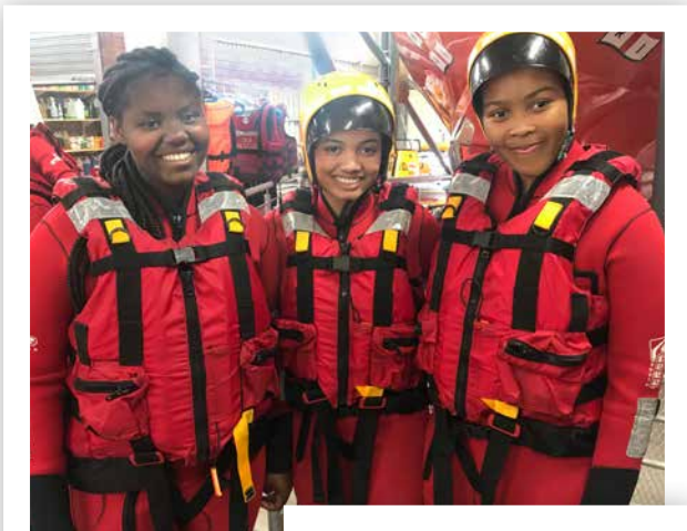
Pre Sea Training - forming a huddle