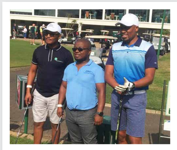
eThekweni Maritime Cluster were proud participants on the day