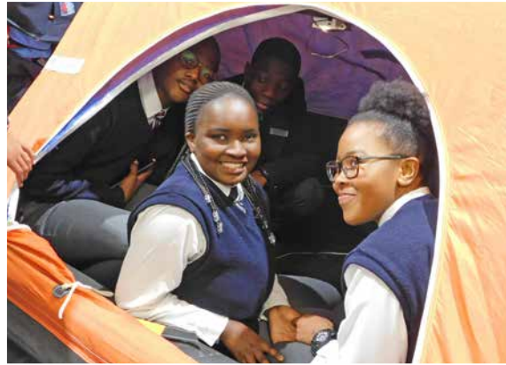
"Trying out" Life saving equipment

Further field trips included a visit to Boatica Cape Town, a boating exhibition which left the scholars wide eyed of the opportunities in the industry.