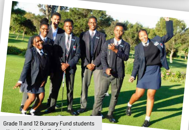
Grade 11 and 12 Bursary Fund students attend the later half of the day.