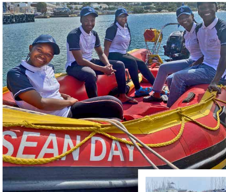
Confident newly qualified Category E Motorboat Skippers

The qualification of 10 students for their skipper's ticket in 2023 was certainly the highlight of the year. It has been a pleasure to train these delightful and extremely well-behaved boys and girls and to work with the wonderful staff of the Bursary Fund and Lawhill Maritime Centre. Many thanks for the support given to me in helping to nurture sea fever in the youth of South Africa.