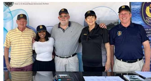
Durban Marine Bursary Golf Day Committee