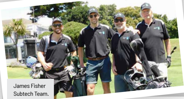
James Fisher Subtech Team.