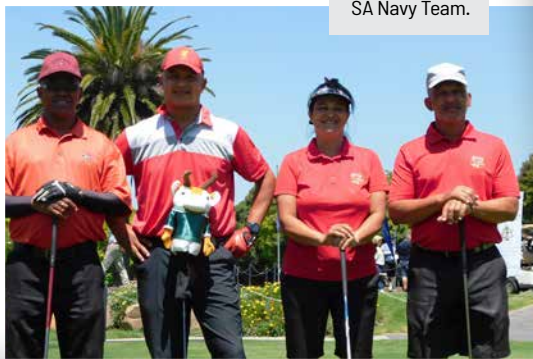
SA Navy Team.